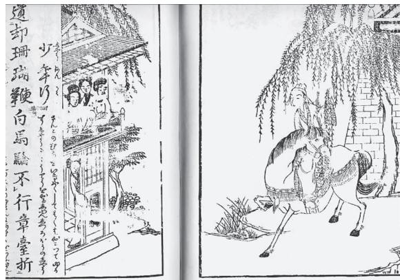
Illustration by Katsushika Hokusai on "Ballad on a Happy Young Men" 13